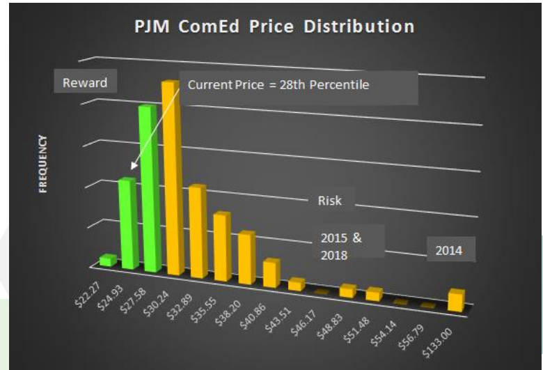
FIGURE A: Historic Price Distribution – Value Price in Green and Risk in Orange